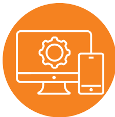
Implementation & UAT