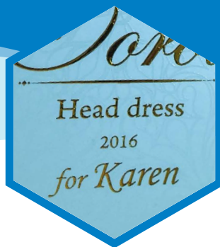
Variable Data Foil (VDF)